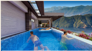
Infinity Swimming Pool